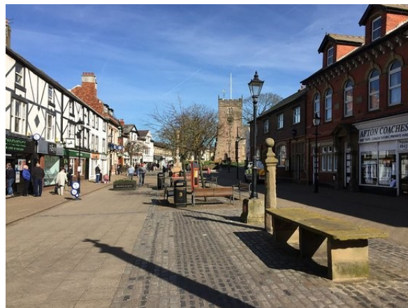
Poulton town centre