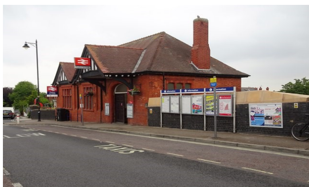
Poulton railway station