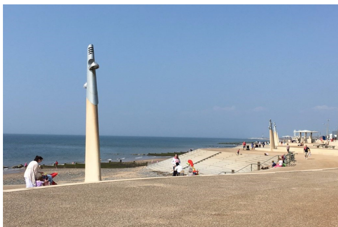
Sea front at Cleveleys