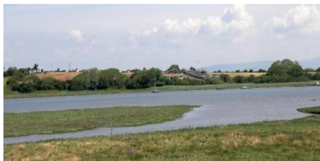
River Wyre estuary at Stanah