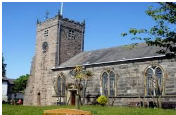
St. Chad's church in Poulton