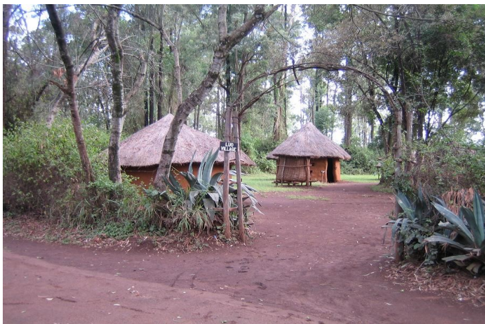
Traditional village in Kenya