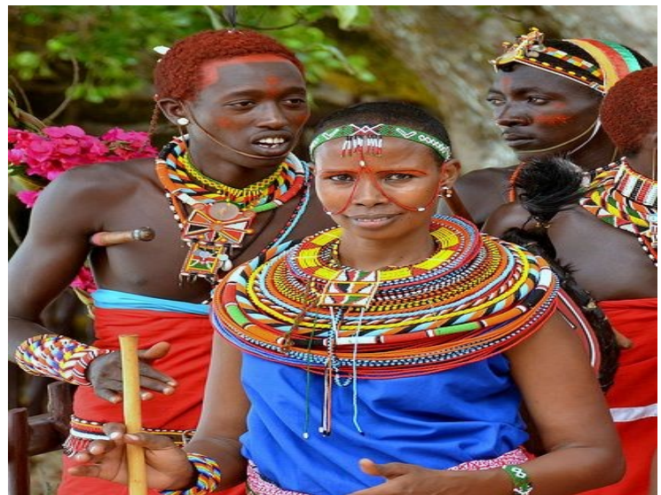
Traditional Kenyan clothes