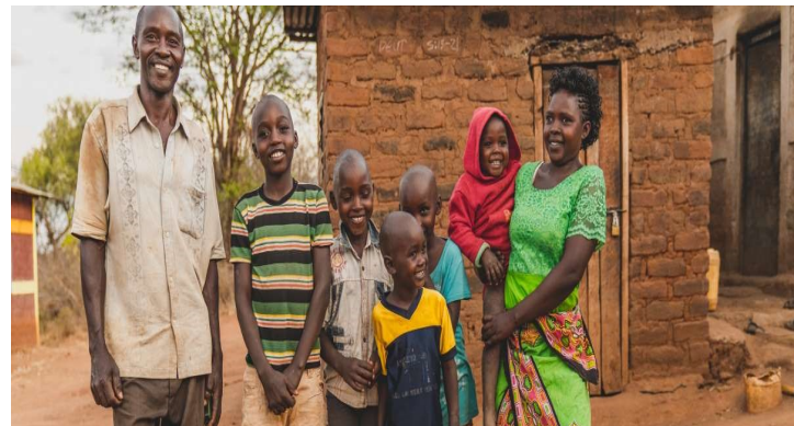
A family in Kenya